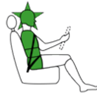
Side impact driver