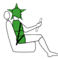
Side impact driver