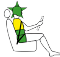
Side impact driver