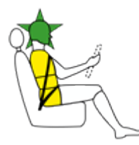
Side impact driver