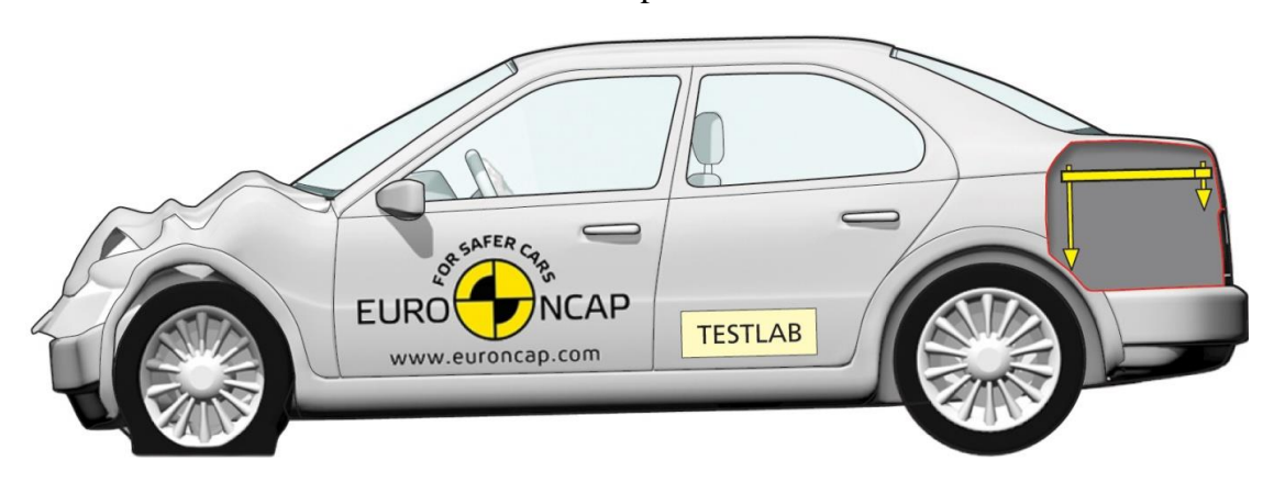
Figure 2. Re-setting axis reference frame after test.

2.2.10 Transform the post impact longitudinal and vertical measurements (x',z') using the following equations.