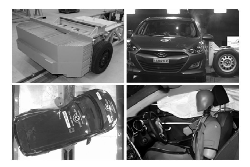
Figure 1. In 2015, the Euro NCAP side impact crash tests will be updated with new elements such as the Advanced European Mobile Deformable Barrier (AE-MDB) [3] and the WorldSID mid-sized male dummy.

realised by assessing the risk of injury of a small female occupant, controlling forward head excursion and chest displacement and penalizing the tendency to submarine (where the pelvis slides under the lap belt, resulting in abdominal injuries). The updated side barrier test will use a mobile barrier that is heavier, stiffer and wider than that used today [3] and a more advanced side impact dummy in the driver seat. In addition, the new oblique pole test, aligned with the GTR procedure, will apply a geometric assessment of the head protection device. This will assess the area covered by side thorax/head or curtain airbags in both front and rear positions for different sizes of occupants (Figure 1).