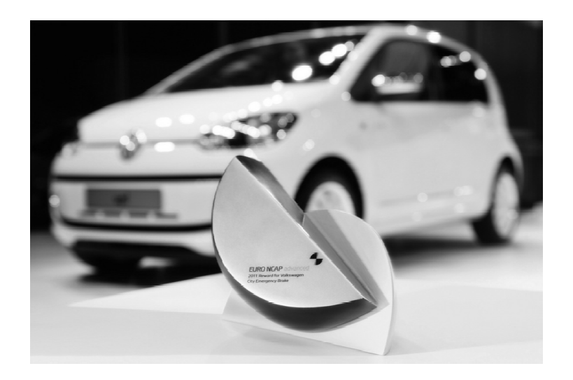
Figure 5. In 2011, Volkswagen received the Euro NCAP Advanced Reward for its City Emergency Brake system on the VW up!. From 2014 onwards, AEB City systems are included in the rating.

The Euro NCAP Advanced assessment process, "Beyond NCAP", is putting high emphasis on the potential casualty reduction of new safety innovations. Hence the reward system also serves as method by which Euro NCAP identifies key important technologies and it paves the way for inclusion of these technologies in the rating scheme (Figure 5).