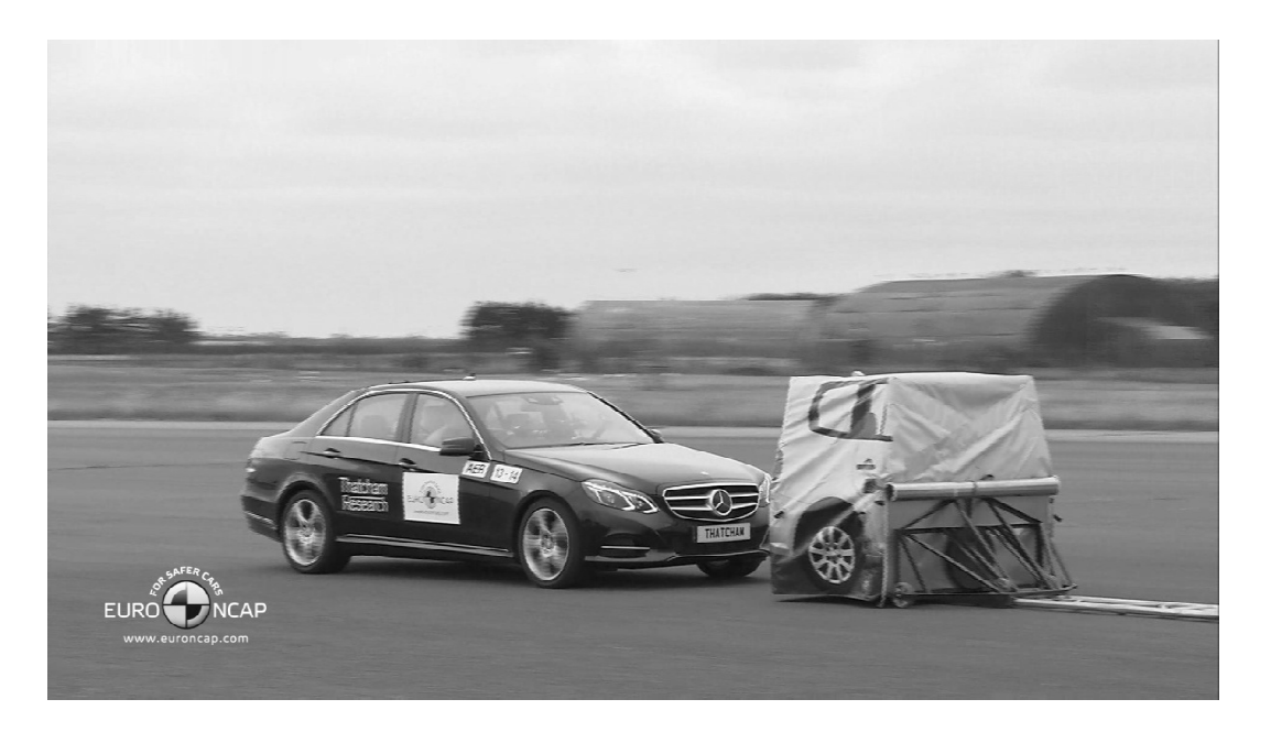
Figure 4. Euro NCAP started to assess AEB systems in 2014 using specially designed "impactable" vehicle target and test equipment.

Following the start of the ESC track testing in the rating scheme in 2011, the assessment of Speed Limitation devices was broadened in 2013 to include intelligent Speed Assistance Systems which employ digital mapping and/or speed sign recognition [6]. In 2014, lane support systems were added to the assessment, as well as autonomous emergency braking systems (which may also include forward collision warning) which help to avoid or mitigate rear-end crashes both at high and low speeds [7]. This will be followed in 2016 with the inclusion of Pedestrian Detection technology (as part of the Pedestrian Protection assessment).