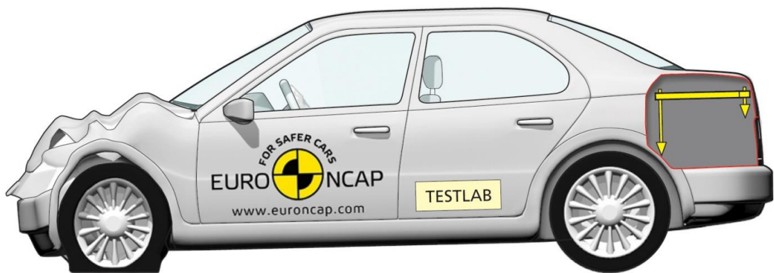
Figure 2. Re-setting axis reference frame after test.