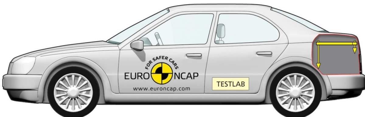
Figure 1. Setting up axis reference frame.