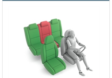
Römer King II LS (Belt)