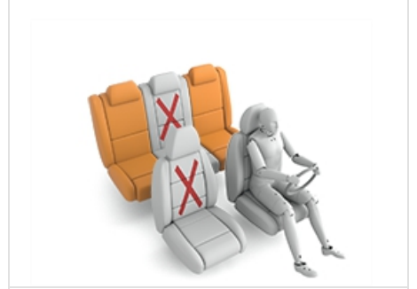
Römer Duo Plus (ISOFIX)