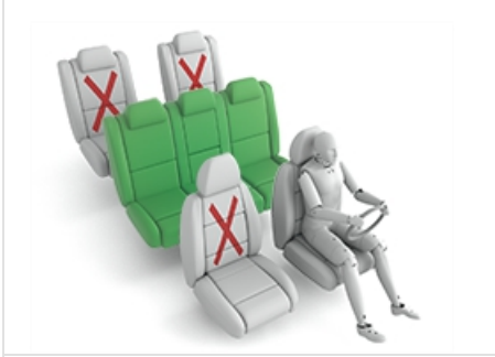
BeSafe iZi Kid X3 ISOfix (ISOFIX)