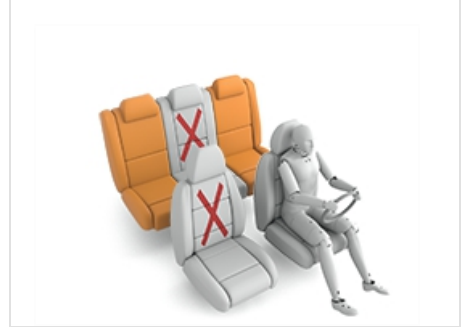
Römer Duo Plus (ISOFIX)