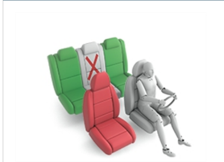
Maxi Cosi Cabriofix & EasyBase2 (Belt)