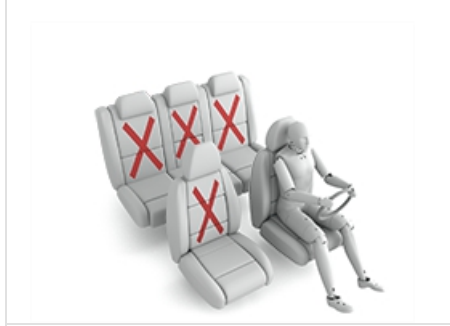
BeSafe iZi Kid X4 ISOfix (ISOFIX)