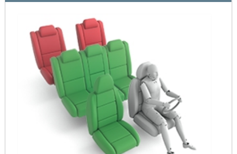
Römer King II LS (Belt)