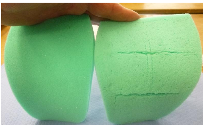
Figure 3 Face foam seen from back, new condition (left), replace if multiple large cracks appear (right)