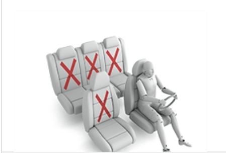
BeSafe iZi Kid X3 ISOFIX (ISOFIX)