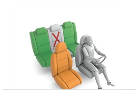
Britax Römer Duo Plus (ISOFIX)