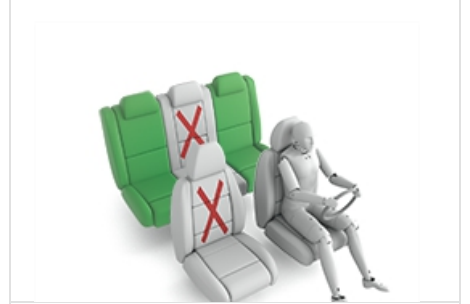
Britax Römer Duo Plus (ISOFIX)