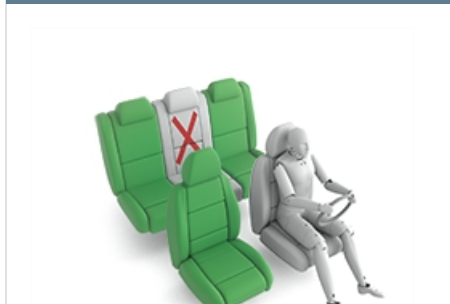
Maxi Cosi Cabriofix & EasyBase2 (Belt)