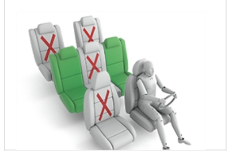
Britax Römer Duo Plus (ISOFIX)