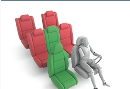
Maxi Cosi Cabriofix (Belt)