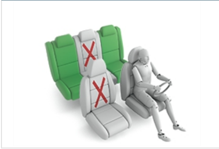
Maxi Cosi 2way Pearl & 2wayFix (rearward) (iSize)