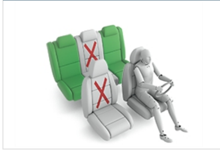
Maxi Cosi 2way Pearl & 2wayFix (forward) (iSize)