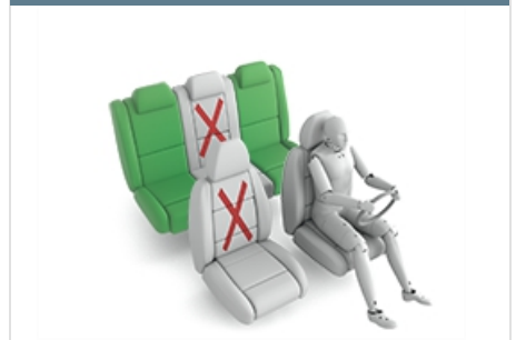
Britax Römer Duo Plus (ISOFIX)