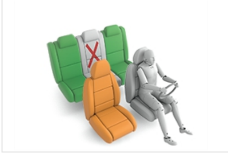
Maxi Cosi 2way Pearl & 2wayFix (forward) (iSize)