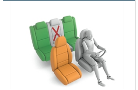
Britax Römer Duo Plus (ISOFIX)