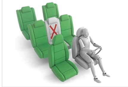
Maxi Cosi 2way Pearl & 2wayFix (forward) (iSize)