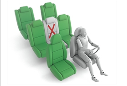
Maxi Cosi 2way Pearl & 2wayFix (rearward) (iSize)