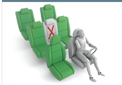
BeSafe iZi Kid X4 ISOfix (ISOFIX)