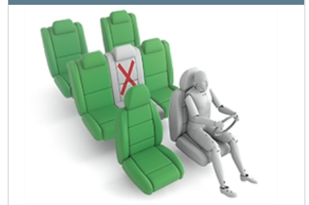
Britax Römer Duo Plus (ISOFIX)