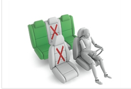
Maxi Cosi 2way Pearl & 2wayFix (forward) (iSize)