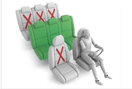
BeSafe iZi Kid X3 ISOfix (ISOfix)