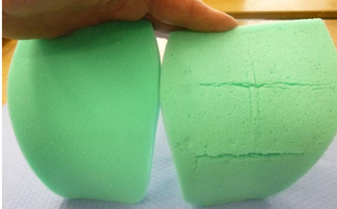
Figure 3 Face foam seen from the back, new condition (left), replace if multiple large cracks appear (right)