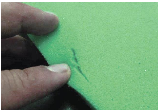
Figure 1 Small tears in rear surface of the foam

3.3.6 No foam certification test is specified at this point, but one may be implemented at a later date.