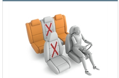
Britax Römer Duo Plus (ISOFIX)