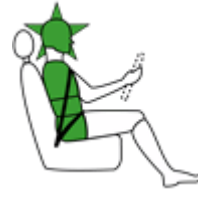
Side impact driver