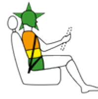
Side impact driver