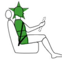
Side impact driver