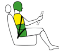
Side impact driver