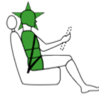
Side impact driver