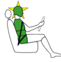
Side impact driver