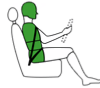
Side impact driver