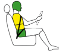
Side impact driver