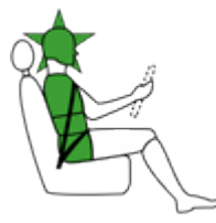
Side impact driver