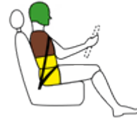
Side impact driver