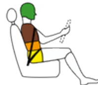
Side impact driver