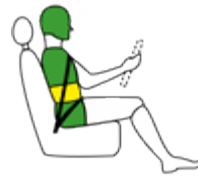
Side impact driver