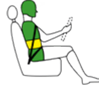
Side impact driver