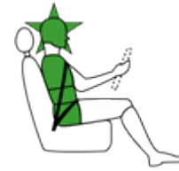
Side impact driver